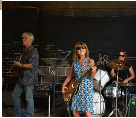
"moogie" energizes the crowd