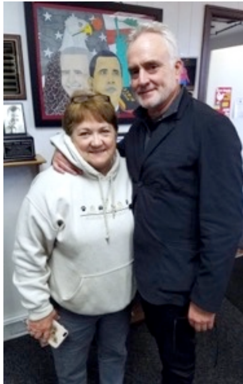
Smooshing with the co-chair