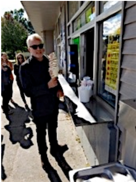
That's a large cone!

Bradley Whitford is a 3 time Golden Globe winner for his part in West Wing a NBC television drama and currently plays Commander Lawrence in the Hulu series and Emmy nominated A Handmaiden Tale . He has always been politically active and is a Madison native.