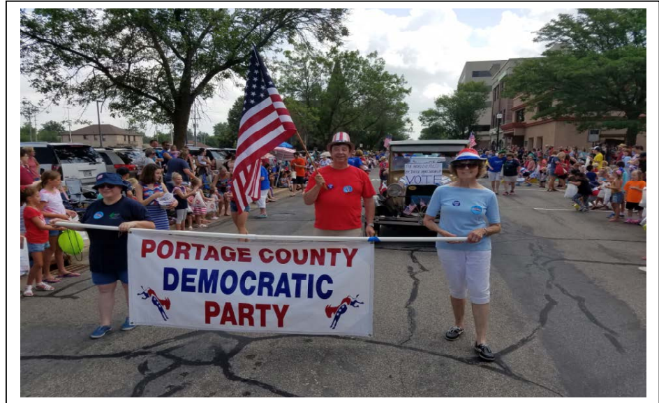
IT'S A PARADE