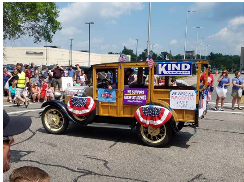
4 TH OF JULY IN STEVENS POINT