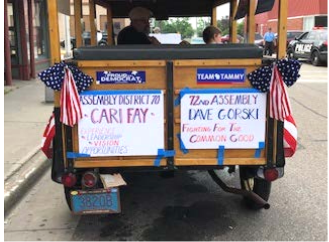
4th of July Parade