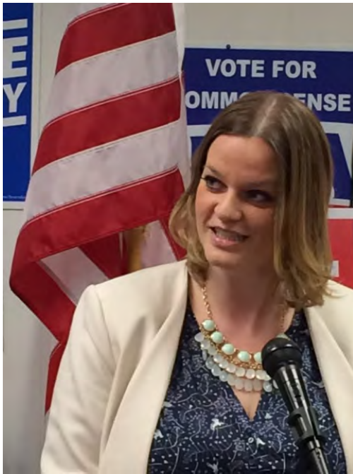
Katrina Shankland, WI. State Assembly