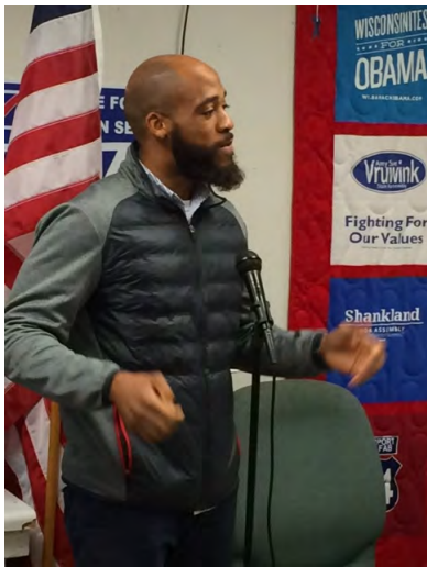
Mandella Barnes, V. Chair candidate

Members in good standing of their County Democratic Party will be voting for State Party chair at the Convention. If you have not registered to attend, you will find all the information you need at the Dem website: http://www.wisdems.org/2017-state-convention