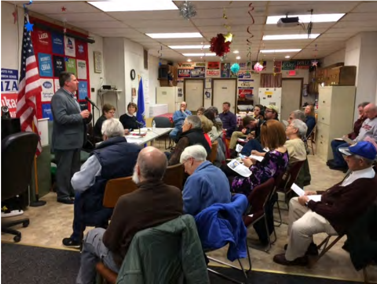
Full House at Dem HQs