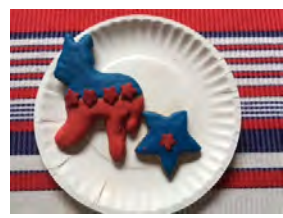
Leigh adds a patriotic theme at the bake sale